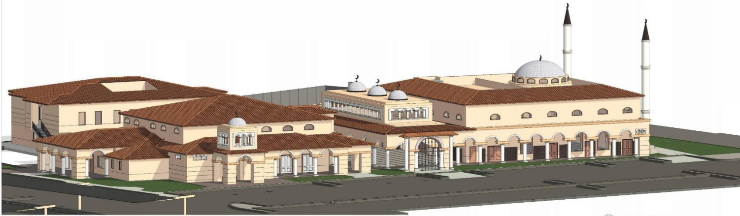
1 Site Rendering 1 Scale