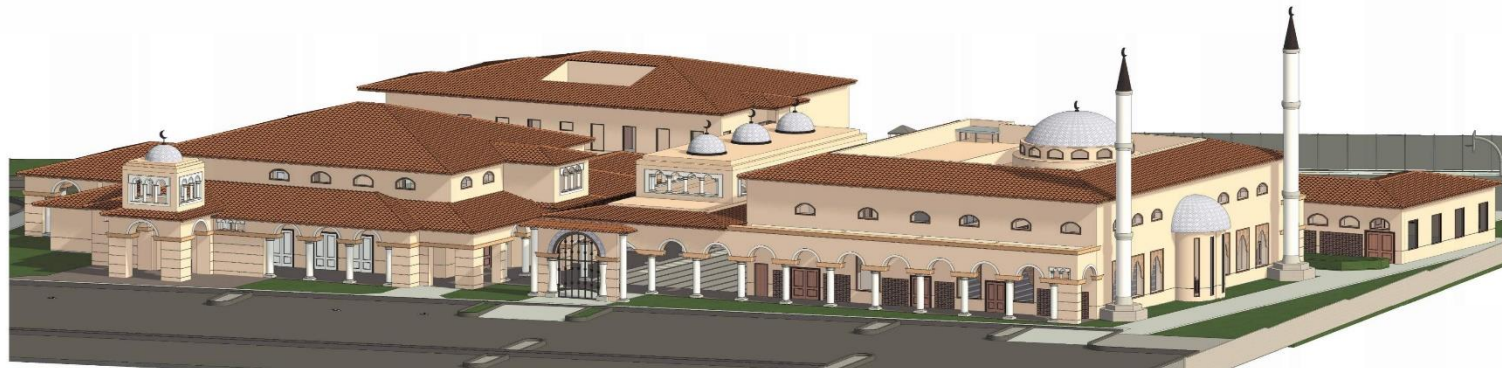
2 Site Rendering 2